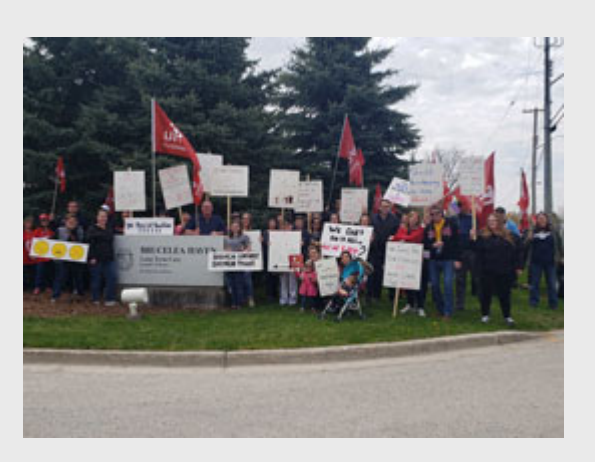
Members at Brucelea Haven in Walkerton protest over unfair scheduling and management disrespect at home for the aged.

Unifor marks Personal Support Worker Day and continues fight for better conditions for health care's unsung heroes.